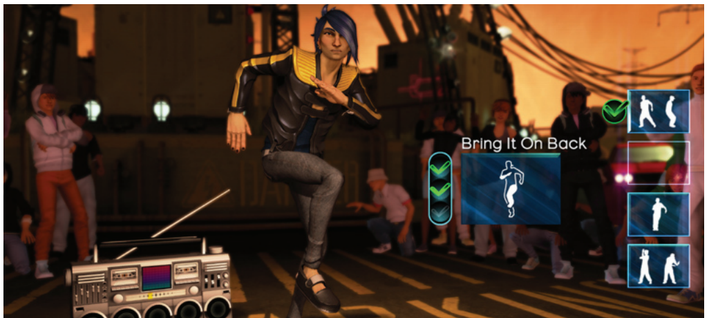
Dance Central.