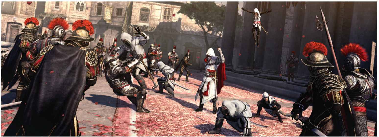
Assassin's Creed Brotherhood.